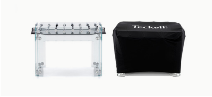
CRISTALLINO INDOOR COVER Suitable for Cristallino Classic, Black and Gold