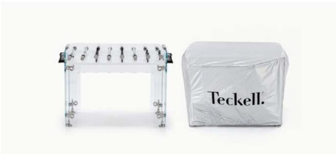
CRISTALLINO OUTDOOR COVER Suitable for Cristallino White Outdoor