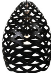
Black (2 sides)