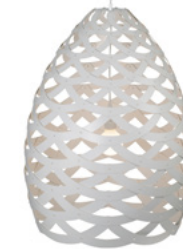
White (2 sides)